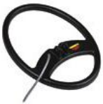
10" x 14" PROformance™ Mono Searchcoil Product: 2215300.....