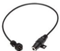
1/4" Headphone Adapter PN: 1626000..... • Allows land-use headphones with a 1/4" male jack to be used with the Garrett AT Gold, AT Pro, Infinium and Sea Hunter models. (Not intended for submerged use.) For More Information