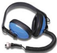
Submersible Headphones PN: 2202100.....